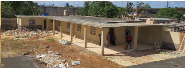
Restoration House... shown here as under construction is now finished.