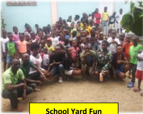
School Yard Fun