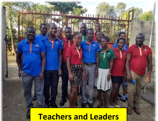
Teachers and Leaders

HAITI: Ministry was difficult since physical contact was not possible this year. However; 2 Cor. 1:3-4: Praise be to the God and Father of our Lord Jesus Christ, the Father of compassion and the God of all comfort, who comforts us in all our troubles, so that we can comfort those in any trouble with the comfort we ourselves receive from God. Through