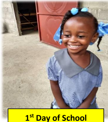
1 st Day of School