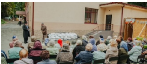
ETHIOPIAN JEWS RECEIVE FOOD & GOSPEL

passed a bill and got it signed by Benjamin Netanyahu. There is about 2000 to 3000 Jews currently in Ethiopia and she has dedicated herself to getting them to Jerusalem – this is an amazing act of God that the government of a country would get behind such a project. God made it happen when there was no way! This is still in process, but we're anticipating some amazing things to happen.