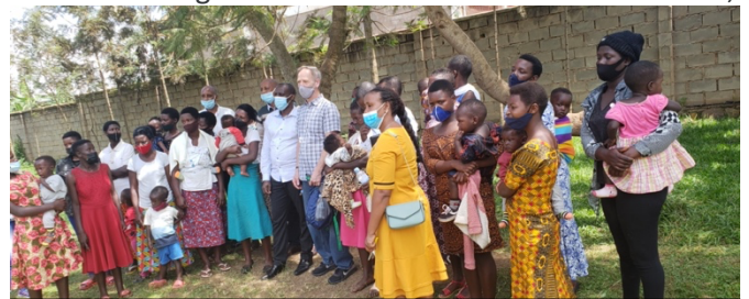
Victims of rape – now teen mothers