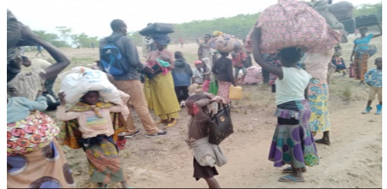
Constantly traveling for safety

“Life is like a mosaic painting. If all you can see is one piece it might seem drab, dull, and dark. But if you can take a step back and look at the whole picture and see how each piece fits with the others, you will see just how beautiful the big picture is and how masterful God is with the colors of our lives.” Imagine during the most tragic of times how love answers the call. Where there are starving people; there are others working on bringing them food. Where there is war; there are others working on bringing peace. How even while we were still enemies of God, we were reconciled to God by the sacrifice of His Son (Romans 5:10). When life is tragic, take heart for God is painting! The women in this picture; victims of rape and forced into pregnancy, have decided that their love is stronger than the hate shown to them. Despite tragedy they are loving these children with all their hearts as good mothers do. Why? Because they understand that when God paints, it is we who are His brushes. – Brian James