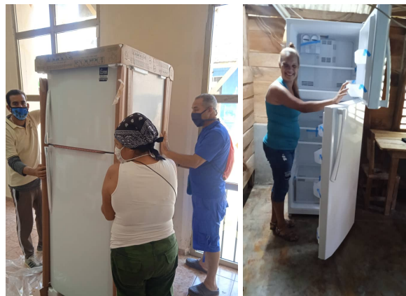
40 years without a fridge – until today!