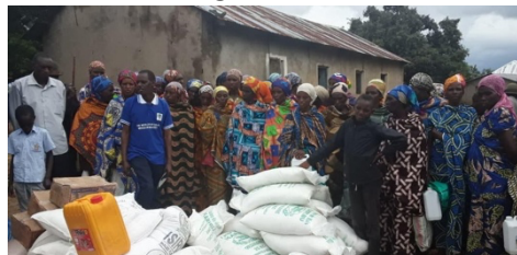
Much needed food distribution

Immediately the prayer teams are notified as Terry shares with them something that has been true from the beginning of time: when