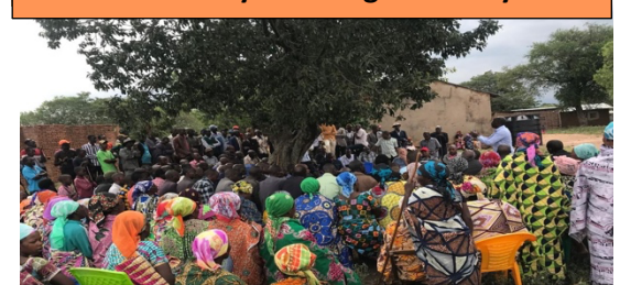
Listening to a message of solace