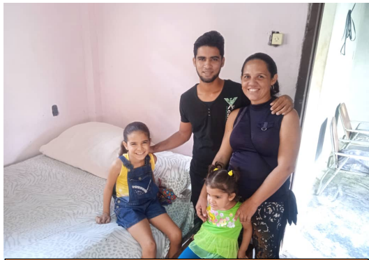
Happy first time home-owners

Dear brothers, certainly God is good. I thank Him with all my heart for His infinite faithfulness. He has surprised me and my family doing a great miracle in front of unbelieving people (my in-laws), showing that God is real and listens to the prayers those who call on Him day and night.