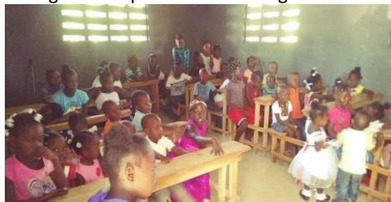
At Risk of Losing Their Education