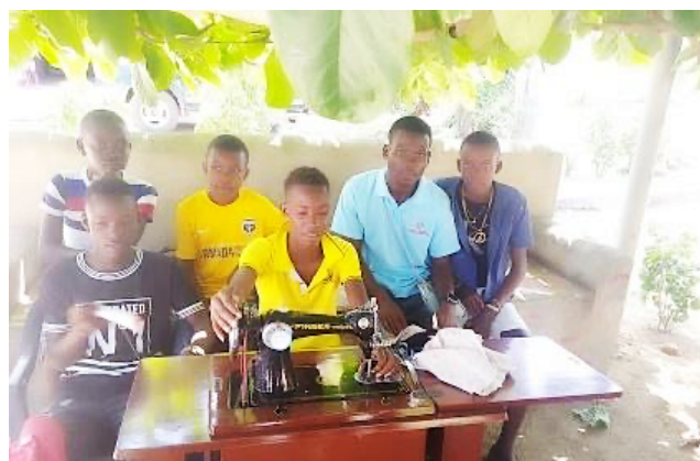
Learning New Life Skills

We have been praying for clarity as to what to do with the boys and girls. No school leads to gang affiliation and teen pregnancies. We are inspired by 1 Peter 4, "Each of you should use whatever gift you have received to serve others" (NIV). We are so thankful to so many of you who have been doing far more than that to support our ministry.