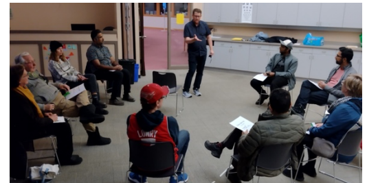
Winnipeg Team Preparing