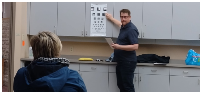
Award Winning Patented Technology!

It's a simple process of using a seeing eye chart placed roughly 4 meters away from the participant. They are initially tested to see where their eyesight level is and the details are recorded. They then use the patented refractor lenses to test one eye at a time until they can see the lowest possible level of the chart with each eye. Finally, according to the numbers indicated on the refractor, a new set of prescription glasses are snapped together bringing "sight to the blind!" The team is currently raising funds both for their trip and for the third case of glasses. A case costs $2500. Would you help 500 people see again with this investment?