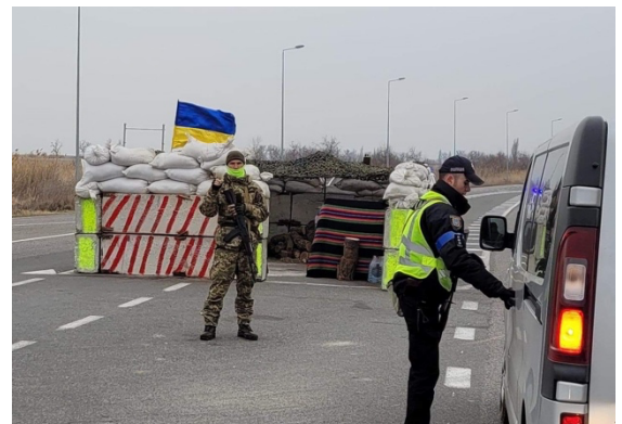
Ukrainians Flee from War