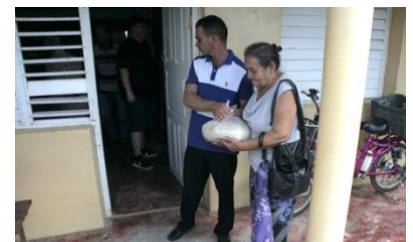
Still praising God