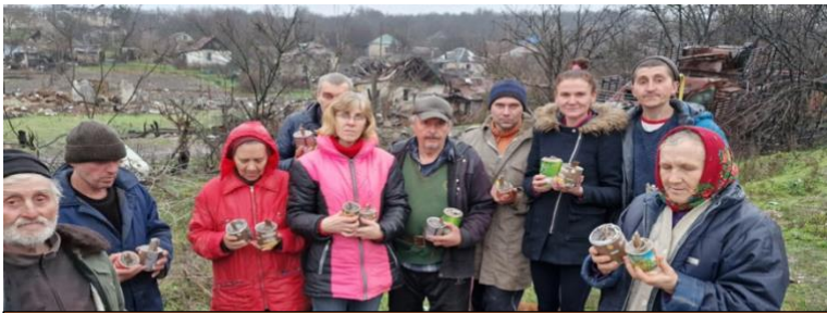
Food distribution lines in volatile places