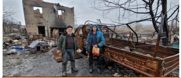
Traveling is dangerous but essential

awareness and need for help from God as well as our gratitude for when help comes. Thank you for your prayers and support. Please pray for Ukraine!