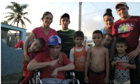
"Struck down but not destroyed"

With much joy, I am happy to share that even though darkness prevails in many areas of the world, there is a light