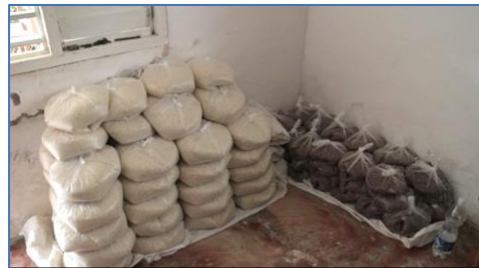
Rice and beans to hand out

Back in August 2022 most of the fuel tankers located in Matanzas exploded, driving the country into a fuel crisis. The officials reported it was a lightning bolt that detonated the tankers. Locals believe it was someone "closer to home" as they heard an explosion prior to the fireball shown to the right. While these tankers burned, the officials were doing a welcome presentation at the airport for some international visitors. Not the same sentiment is shown for the people in Pinar Del Rio. Apathy. It concerns me for my family in Cuba.