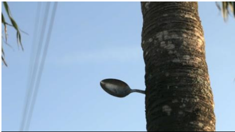
Result of 185 km/hr winds

Province of Pinar Del Rio, Cuba: I had a mix of emotions on this trip. When I went to help Baracoa Cuba after Hurricane Matthew hit in 2016, it looked as if someone dragged a giant blender across the face of the earth. I had never seen devastation like that before – you can see a video report at ceoministries.ca in the videos section. When I heard that Hurricane Ian hit Pinar Del Rio much worse than Baracoa, I wasn't sure what to expect.